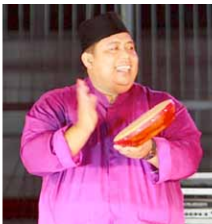
Figure 3. Rebana Anak drum, Brunei.