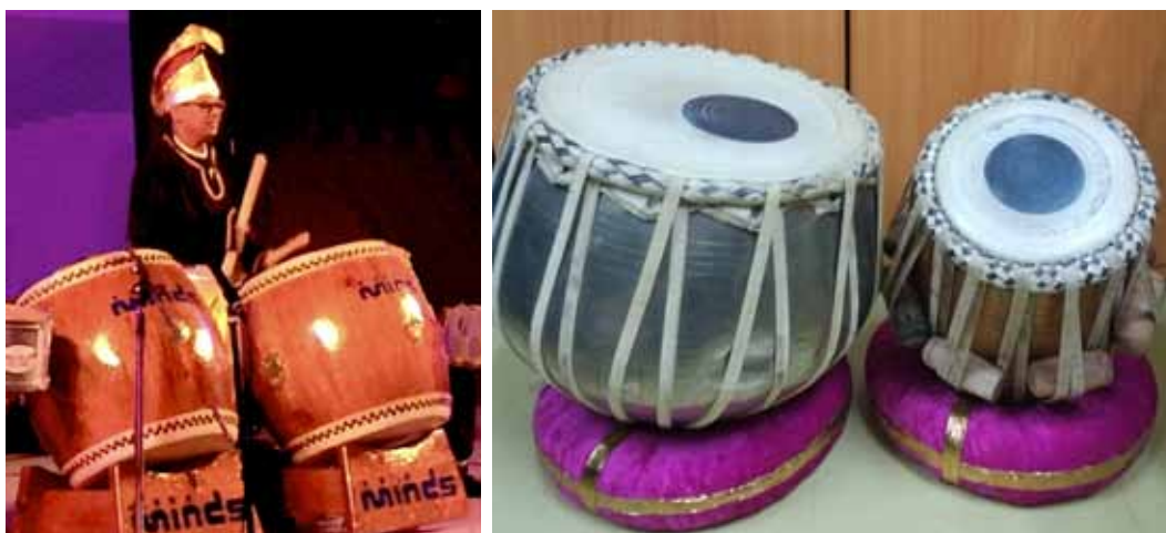
Figure 9. Chinese drums, left and Indian Tabla drums, right, Singapore.