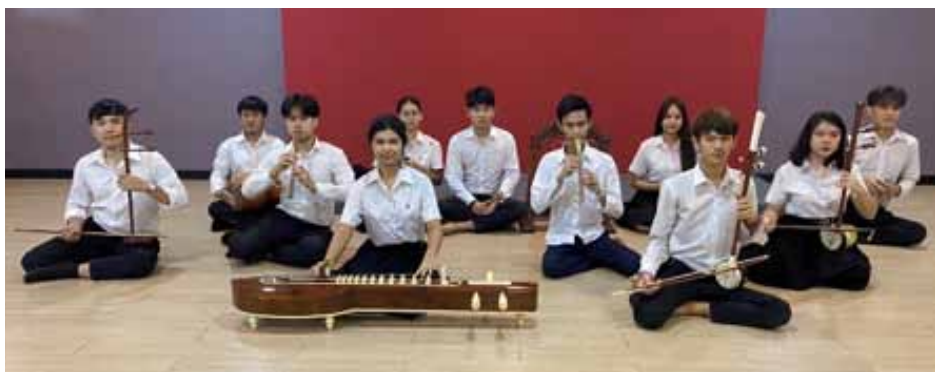
Figure 14 Thai ensemble performing the Sakodai composition.

The composed pieces of music in this research are played with Thai traditional instruments (see figure 14) complemented by a Kantrum fiddle and Or oboe, instruments unique to a Kantrum band 11 . The band is composed of a Kantrum fiddle, Ja-khe, Or oboe, Pheang Or flute, Sor Duang (soprano fiddle), Sor U (alto fiddle), Sakodai (hand drum), small cymbals, Grub (Thai clappers) and Mong (gong) 12 . This arranged Thai mix with Khmer instruments corresponds to the instruments played in folk bands in Cambodia that comprise a Or flute, Kro-pur (Thai Ja-khe /a zither), Jubpei (Thai Krajubpi /a kind of vina), Kha-sae-deo (Thai Phin Namtao /a gourd vina), Trua Khmer (Thai Sor Samsai /a three string fiddle), Trua Sothom (Thai Sor Duang / a soprano fiddle) and Trua U (Thai Sor U /an alto fiddle).