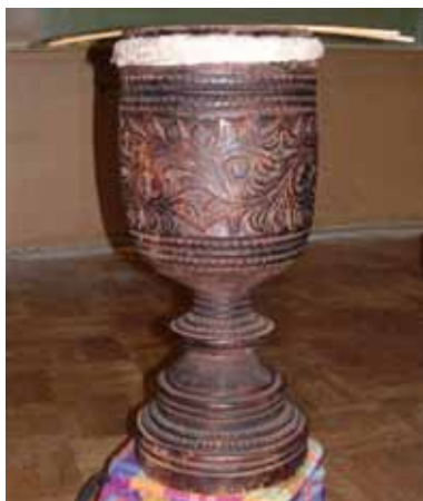
Figure 5. Debakan drum, Philippines.