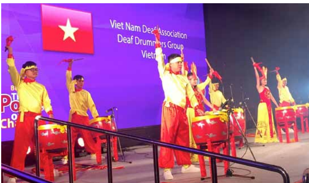
Figure 8. Tay Son drum, Vietnam.