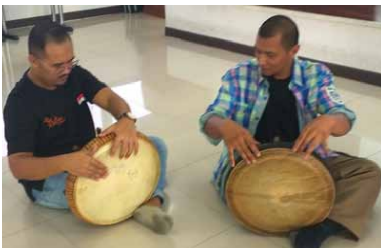
Figure 6. Rebana Ibu drum, Malaysia.