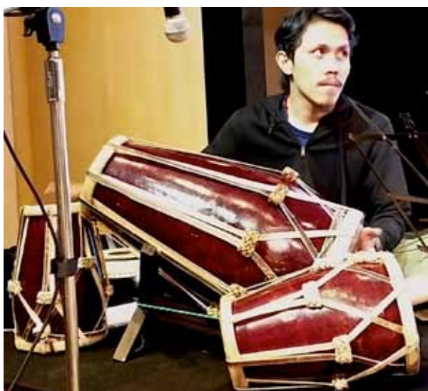
Figure 10. Kendang drums, Indonesia

Inspired by these instruments, the researcher has composed eleven pieces of music with different musical dialects. The researcher was inspired by the rhythmic patterns of these drums to reflect the art and cultural significance as well as identity of each ASEAN country's music. The research can also be used as a guideline for further studies and the composition of pieces in different linguistic dialects.