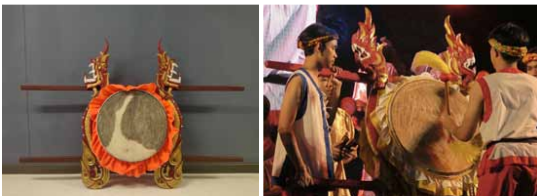
Figure 2. Sabadchai drum, Thailand.