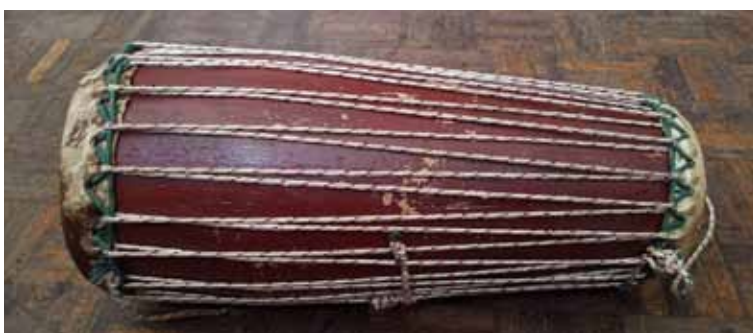
Figure 7. Ping drum, Laos.