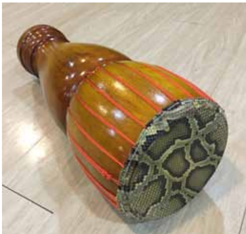
Figure 1. Sakodai drum, Cambodia.